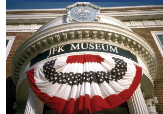
Visit to the JFK Museum