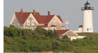
Lighthouse overlooking Vineyard Sound

Day 5: Today, after enjoying a Continental Breakfast, you will depart for home... a perfect time to chat with your friends about all the fun things you've done, the great sights you've seen, and where your next group trip will take you!