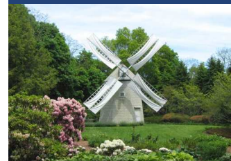
One of Cape Cod's many Windmills